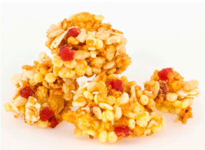
Breakfast fruit cluster