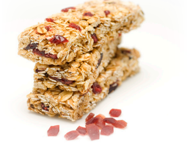
Fruit cereal bars