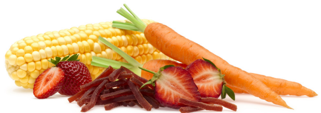
Fruit & vege pieces